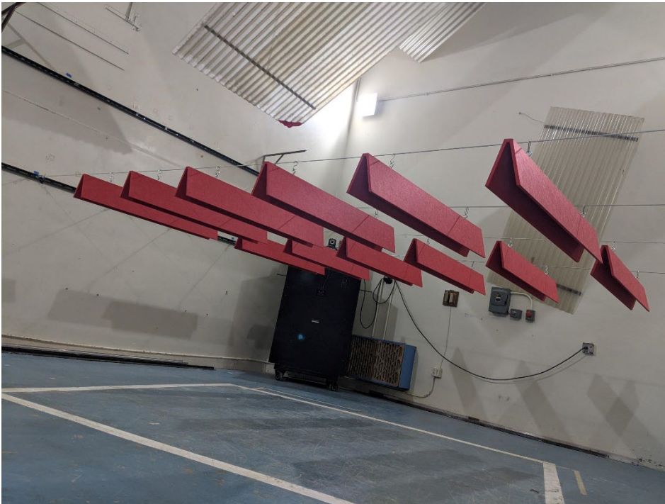
Figure 2 – Specimen mounted in test chamber