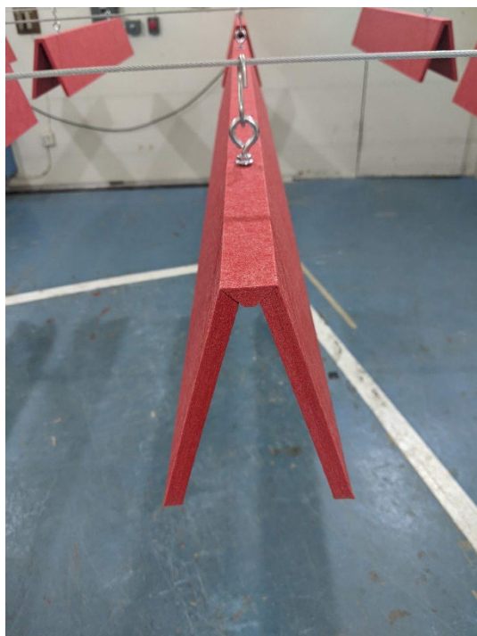
Figure 3 – Detail of specimen materials